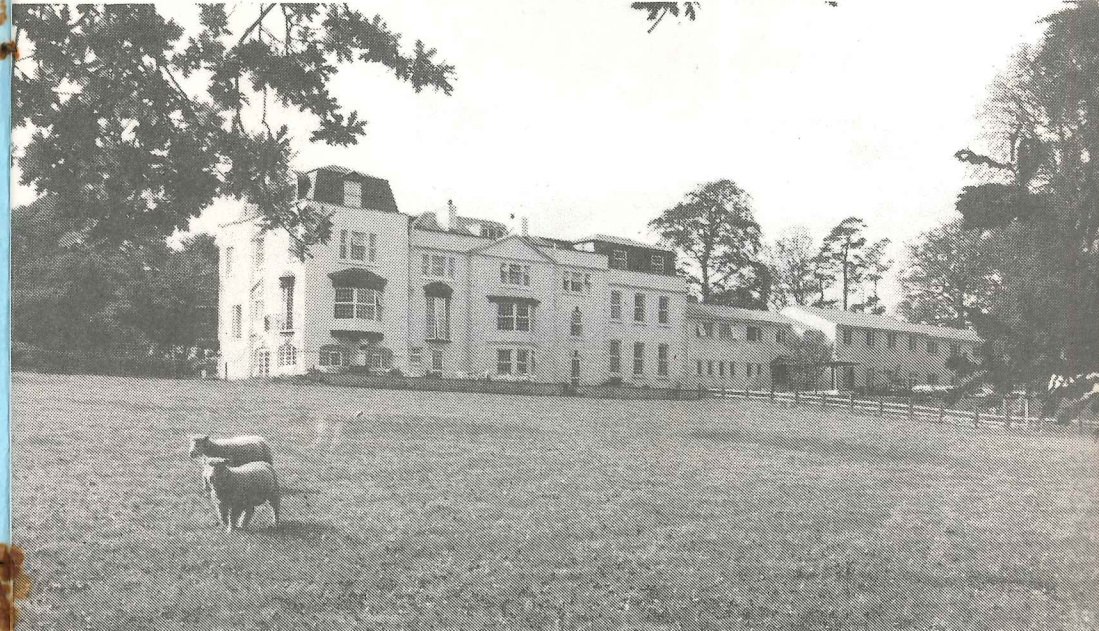
The Priory, Winford Manor

Fifth collected Edition 1994 Omega Publications, Winford Manor Priory, Winford, Avon BS18 8DW U.K.